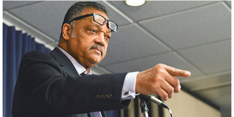
Rev. Jesse Jackson says that closing neighborhood schools too often divorces parents from their students’ schools. Photo taken during a panel discussion on the the Voting Rights Act of 1965 at the National Press Club in Washington, D.C. on February 18, 2015