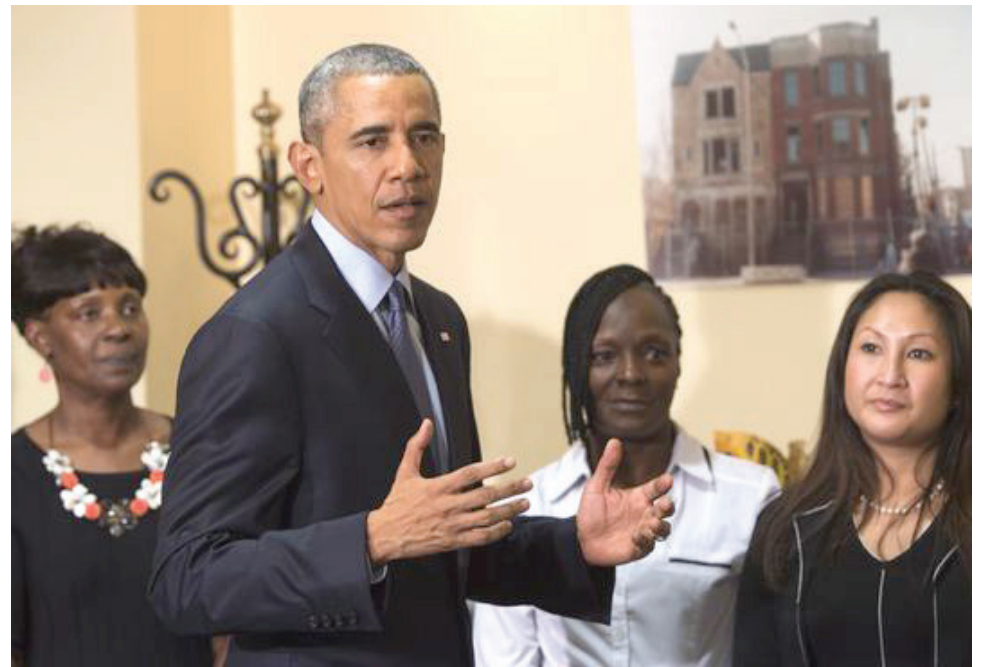
President Obama speaks about the re-entry process for formerly incarcerated individuals, alongside residents and managers of Integrity House, a halfway house in Newark, N.J.